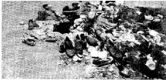
TENNIS SHOES, SHIRTS, jackets and other personal belongings, trampled in the stampede at the arena doors, were swept into a pile inside the empty coliseum lobby.

them climbing over gates or something. There were kids up and over everything. There was a lot of screaming and yelling." When Barbara reached the carnage, the lone officer began shouting, "Back up, everybody back up," she said. "I tried to back up but most of the people kept pushing." FINALLY, THE STEFFS, 2152 Alpine Place, reached each other and tried to retreat. "We could see bodies, at least four of them on the floor. They had their shirts off and were giving them mouth-to-mouth resuscitation to try to revive them." Doggedly, the Steffs tore up their reserved-seat tickets and began to leave. "Some kids came running by with this person in their arms. We saw another one on a table. They had his shirt off, trying to bring him around." Barbara said many officers they encountered on the coliseum plaza were not aware of the fatalities. Michael, 36, said he noted a clock as they retreated from the maelstrom. It was 8 a.m. "People were angry," he said of the crowd they encountered when they arrived after 1:30. "The crowd had been building up. Barbara saw at least one bottle thrown."