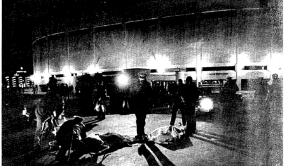
POLICEMEN PREPARE to carry away the bodies of two of the 11 victims killed in the stampede before The Who rock concert at Riverfront Coliseum.