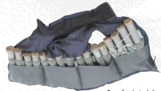
Type of explosive belt